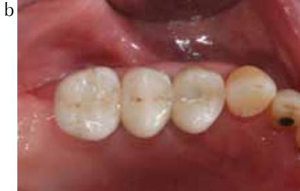
Fig 3a-b: Screw retained porcelain bonded to metal bridgework has been secured to MultiUnit Abutments which have been secured to the fixture heads at the time of surgery. Note that the small screw-access holes are easily disguised.