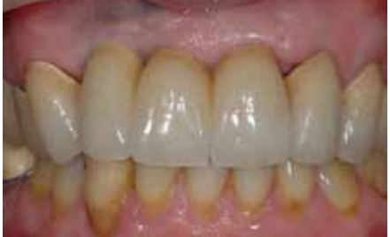
Fig 1a-b: The abutment screw emerges to the buccal, therefore there is no option but to cement an implant crown into place on these milled titanium Procera abutments. Note superficial margins on both teeth and implant abutments.

has been screwed into place the cement-retained crown will cover the screw-access hole (figs 1a -b). This is particularly important for anterior restorations, as it can be difficult or undesirable to position the implant with the screw-access hole palatal. Cement retention has been used more and more, as the laboratory and prosthodontic aspects of treatment are so similar to those used for the restoration of teeth.